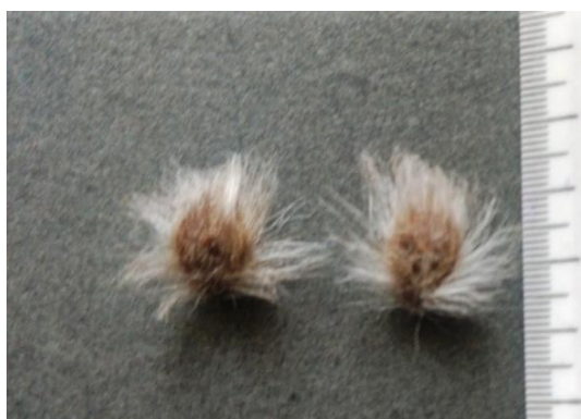
Figure 4. Seed of Ipomoea carnea ,

The seed measures 0.4-0.6 cm in length and 0.2-0.3 cm in diameter, dark brown to black and derived from an anatropous ovule. It is covered with an easy removable dense pale brown to greyish brown trichomes, which attain 0.7-1.0 cm in length. The seed is three-sided, with two flat ventral surfaces that may have a central depression and one convex dorsal surface. The micropyle is represented by a paler scar near the hilum in the central depression of the ventral surface. The raphe is represented by a raised ridge which extends from the hilum at the base to the chalaza at the apex. The seeds are covered by a dense, cottony, furry indumentum consisting of slightly glossy, and 0.01-0.02 mm thick hairs that are slightly swollen at the base. Hairs are much longer on the edge of the rounded abaxial surface of the seeds (at the top and at the base of the elliptically complanate cross-section). The seeds have a black, 0.3 mm thick, very hard, bilayered testa (Fig. 4).