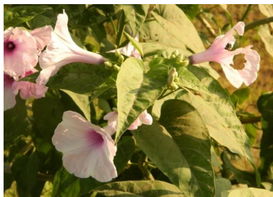
Figure 1. Habit of Ipomoea carnea

Large shrubby erect up to 3 m in height, fistular stems, glaucous having latex. Leaves broad ovate, 14-22 x 10-13 cm, base truncate, entire margin, acuminate. Flowers pink, funnel form in dichotomous, axillary and terminal cymes. Calyx lobes 5, unequal broadly ovate. Corolla unnel form, lobes 5. Stamens 5, hairy below. Bicarpellary Ovary, tetralocular, 1 ovule per locule, placentation, axile. Capsules globose or ovoid, seeds hairy. (Fig. 1)