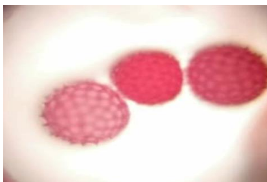
Figure 8. Pollen of Ipomoea carnea ,

The pollen morphology of Convolvulaceae is known to be highly diverse and has taxonomic importance. The present study was undertaken to know the pollen morphology of Ipomoea carnea by Light microscope. Pollen grains oblate spheroidal, radially symmetrical, outline circular, pantoporate, tetragonal area formed by the spine and the ridges of bacula around each extrapolar region, aperture circular sculpturing echinate, spine bulbous protuberance at the base of spine, exine microreticulum between the spine and on the bulbous base. (Fig.8)