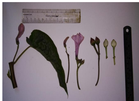
Figure 2. Morphometric of Ipomoea carnea ,

shape, with entire margin, symmetric base and acute apex, green in colour, nearly glabrous, measure 0.4-0.7 cm long and 0.6-0.7 cm width. The corolla is formed of 5 united petals (sympetalous), delicate, pinkish white in colour, with 5 pink to violet coloured strands in the regions of cohesion with each other. The mouth of the corolla has an entire margin, with slight conspicuous depressions at the points of the cohesion of the petals, measure 4.7-6.0 cm long and 1.6-1.8 cm width at its mouth.