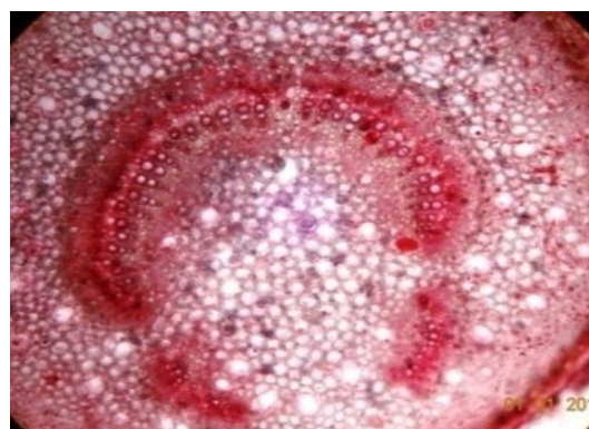
Figure 6. T.S. Petiole Ipomoea carnea ,

Upper Epidermis Single layer, Polygonal parenchymatous cells with trichomes. Upper Palisade 2-3 layers of elongated parenchymatous. Spongy parenchyma Presence of parenchymatous cells between upper and lower palisade. Lower palisade same to upper palisade 1-2-layer cells. Lower Epidermis Similar to upper epidermis with more trichomes. Collenchyma Presence multiple layers of both upper and lower end of midrib. Vascular Bundle Dorsal side of leaf contains lignified xylem and non-lignified phloem fiber. Trichomes Glandular epidermal multicellular, branched, thin-walled trichomes Stomata Presence of paracytic type stomata. (Fig.6)