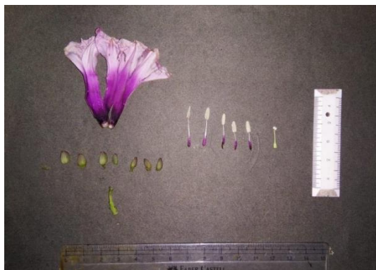
Figure 3. Morphometric of Reproductive parts of Ipomoea carnea ,