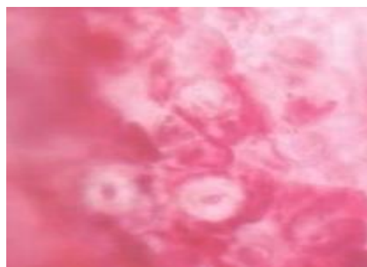
Figure 5. Stomata Leaf of Ipomoea carnea

with other characters, these may be used as major criteria in the subdivision of the family into tribes, genera etc. The trichomes do afford useful characters for taxonomic separation at generic and specific levels. It has been found that considerable differences exist in the characters of epidermis such as distribution of stomata on the upper as well as on the lower epidermis, nature of indumentum, shape and size of the stomata and associated epidermal cells, degree of sinuosity of the upper and lower epidermal cells and others. There is appreciable difference in the degree of sinuosity between the upper and lower epidermal cells of many species of Convolvulaceae. (Fig.5)