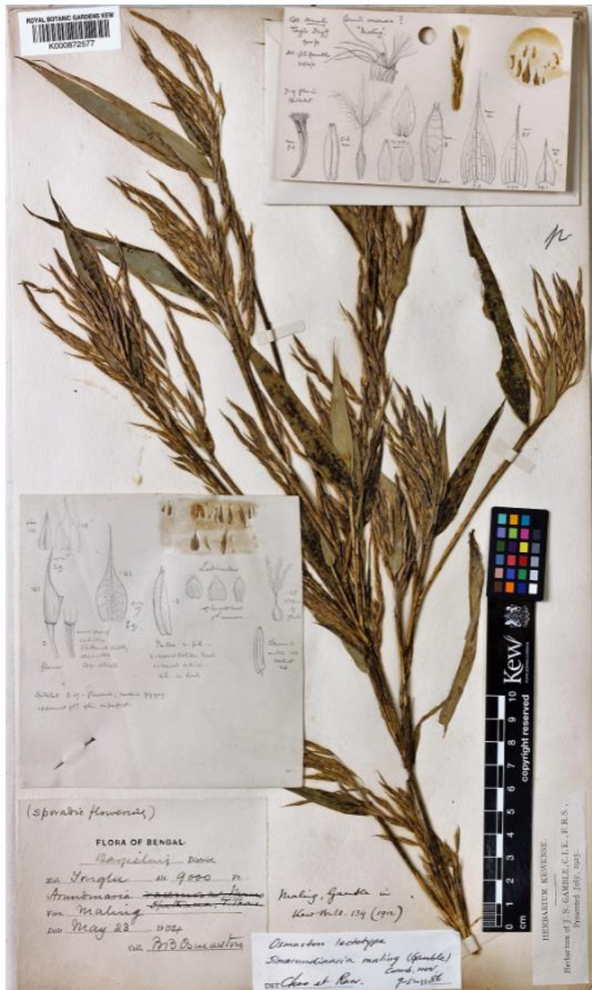
Figure 1. Second-step lectotype of Arundinaria maling Gamble (K000872577).