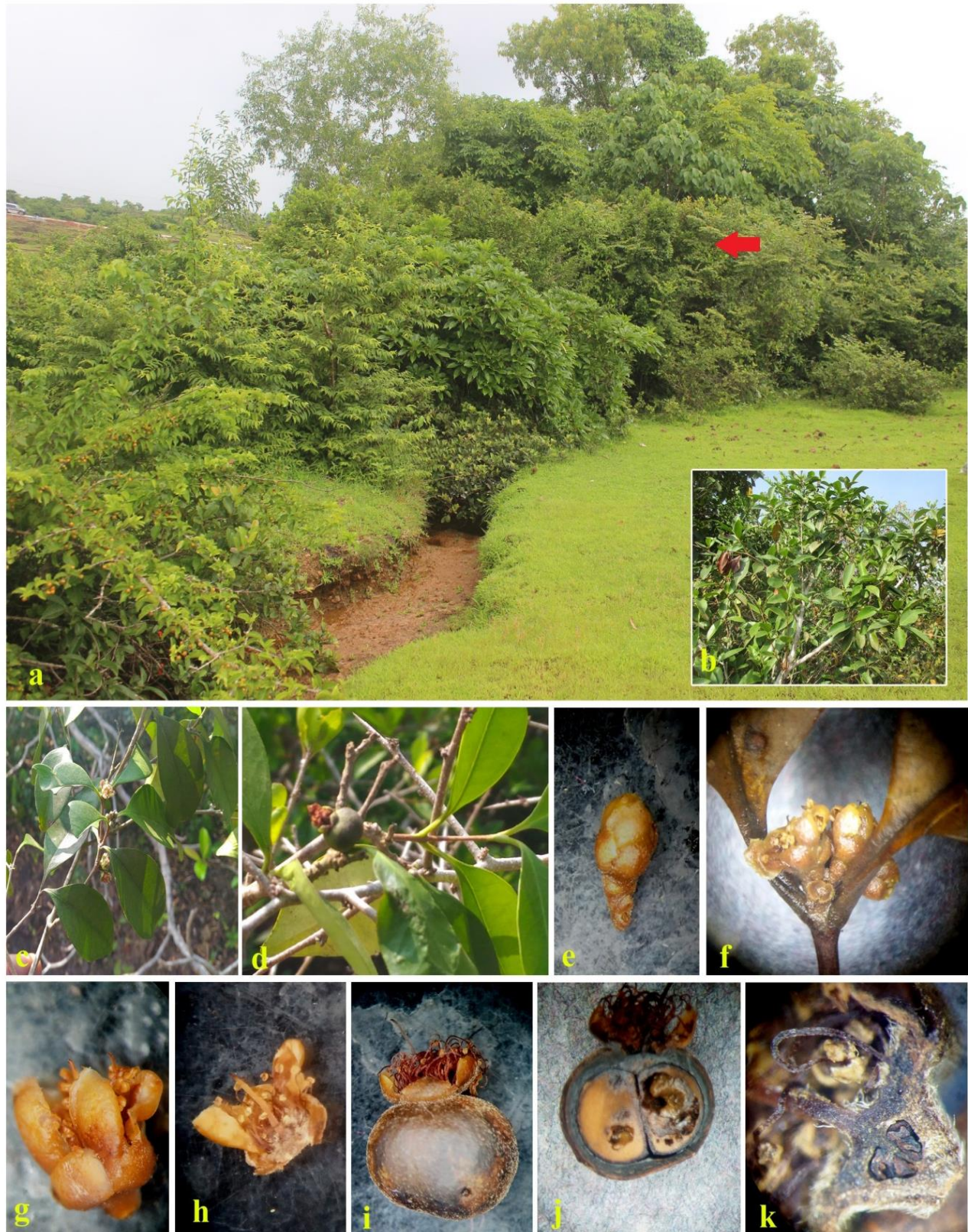
Figure 1. Eugenia codyensis Munro ex Wight var. obovata Rijuraj, Rajendraprasad Shareef & Shaju var. nov. a: Habitat. b: Habit (inset). c: Flowering twig. d: Fruiting twig. e: Flower bud. f: Inflorescence. g: Single flower. h: Flower L.S. i: Fruit. j: Fruit L.S. k: Hypanthium L.S. showing ovary.