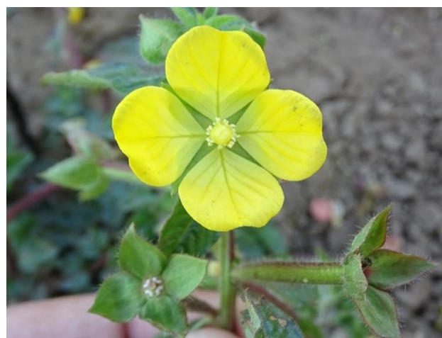
Figure: Ludwigia peruviana (L.) H. Hara

quadrangular, c. 1.3 cm long, villous; bracteoles 2, subulate, as long as or slightly longer than the ovary. Sepals 4 (or 5), lanceolate to ovate-lanceolate, or deltoid-acuminate, 1.5-2.3 x 0.5-1 cm, irregularly serrulate at margin, fleshy, villous outside, glabrous inside, 9-nerved. Petals suborbicular, 1.5-2.5 x 1.5 - 2.5 cm, shortly clawed, slightly emarginate, yellow with brownish nerves. Stamens 8 or 10, subequal, yellow; filaments 1.5-3 mm long; anthers 1.5-3 mm long, apparently basifixed by reduction, somewhat extrorse. Disc much elevated; nectary depressed, U or C-shaped, densely white hairy, surrounding the base of each petaliferous stamen. Ovary quadrangular, 8-10 mm long, pubescent, 4-loculed; ovules 3 per locule; style c. 1 mm long, thick; stigma elongated-hemispherical to ellipsoid, longer than style, c. 3 mm across. Capsules sharply quadrangular, 1.3-3 x 0.5-1 cm, thin-walled, with 4 prominent deep brown ribs, villous, irregularly loculicidal; seeds pluriseriate, free, ellipsoid, c. 0.79 x 0.38-0.40 mm, with a prominent nipple and transversely striped integument, brown; raphe c. 0.70 x 0.16 mm.