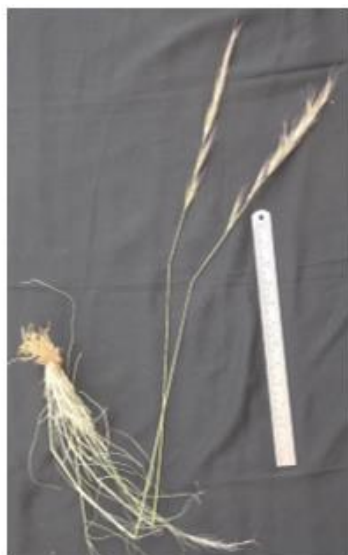
Figure 1 a & b: Aristida funiculata