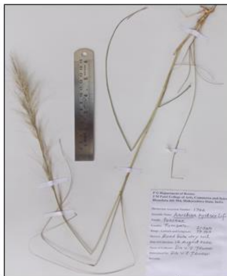
Figure 2: Aristida hystrix