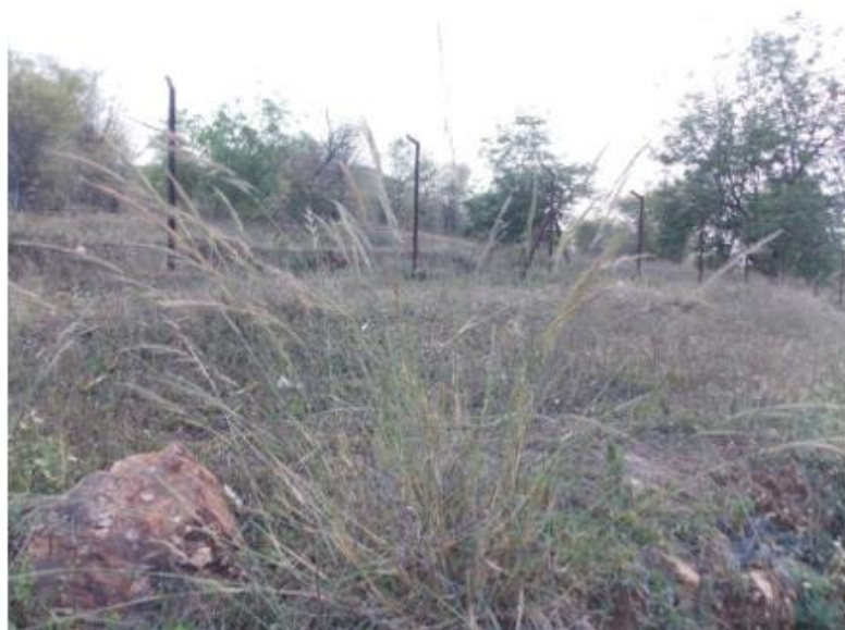
Figure 3: Aristida setacea Habitat