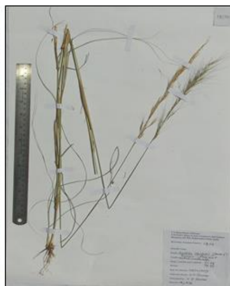
Figure: 4: Aristida stocksii